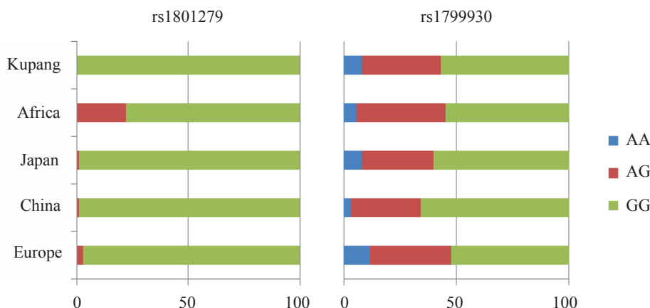
Figure 3. The distribution of rs180279 and rs1799930 in population from Kupang compared to other populations.

In a subset of the population (n13), acetylator status was well determined using PCR-sequencing method, resulting in individuals with rapid acetylators (NAT2*4/*4; n=4), intermediate acetylators (n7, including NAT2*4/*5 n=1; NAT2*4/*6 n=1; NAT2*4/*7 n=5) and poor acetylators (n2, including NAT2*6/*6 n=1; NAT2*7/*7 n=1) as detailed in Table 2. Furthermore, we have assessed the results of rs1801279 and rs1799930 using PCR-sequencing and using mass-screening, and verified that both results were similar.